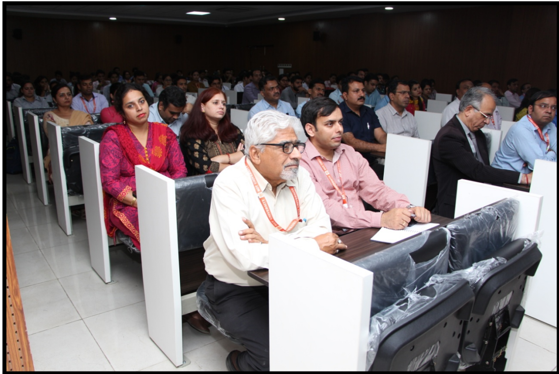
Faculty members as audience for the expert talk

Budhera, Gurugram-Badli Road, Gurugram (Haryana) – 122505 Ph. : 0124-2278183, 2278184, 2278185