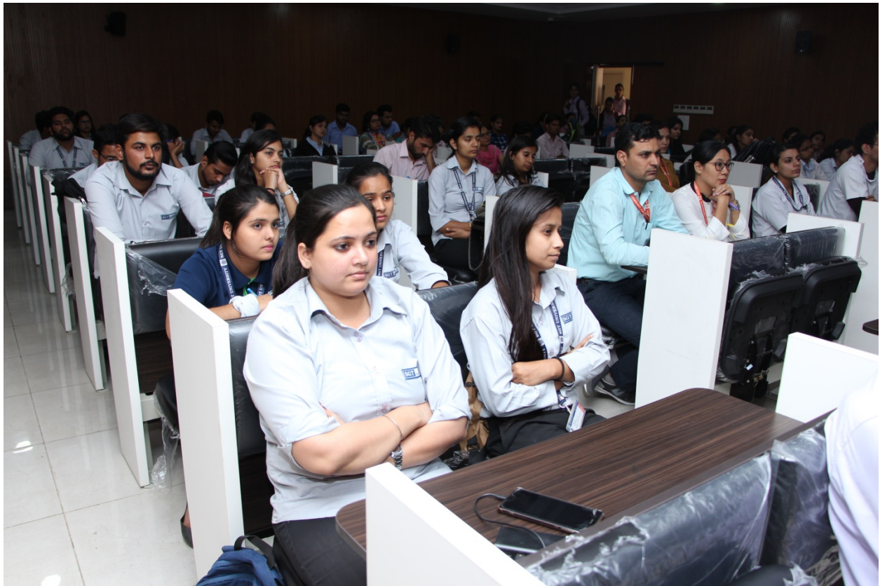
Students as audience for the expert talk

Budhera, Gurugram-Badli Road, Gurugram (Haryana) – 122505 Ph. : 0124-2278183, 2278184, 2278185