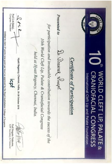
Scanned with CamScanner