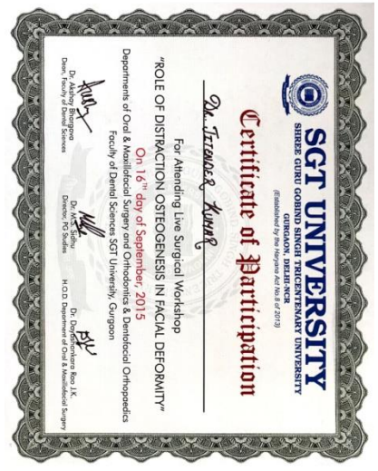
Scanned with CamScanner