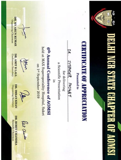
Scanned with CamScanner