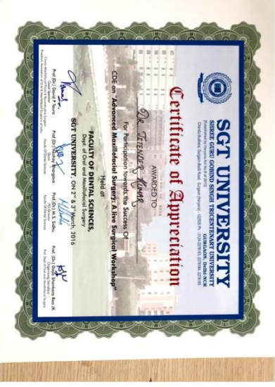
Scanned with CamScanner