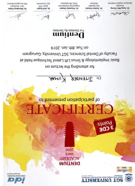
Scanned with CamScanner