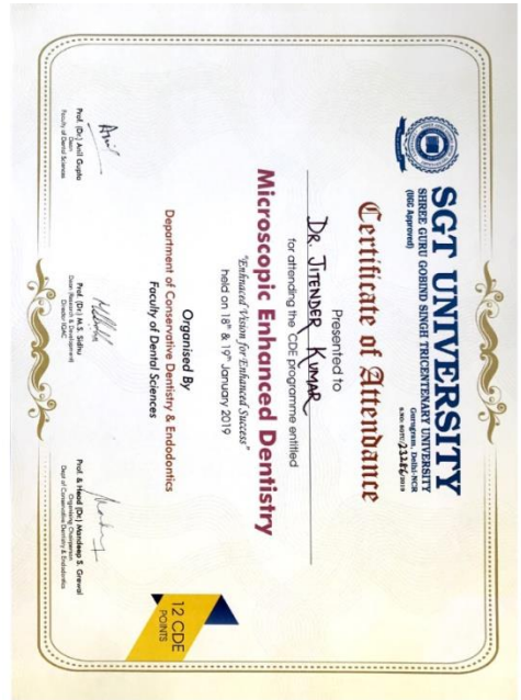
Scanned with CamScanner