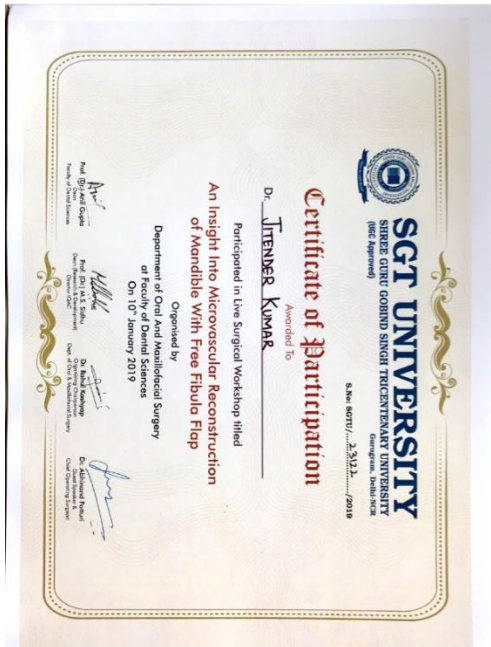
Scanned with CamScanner