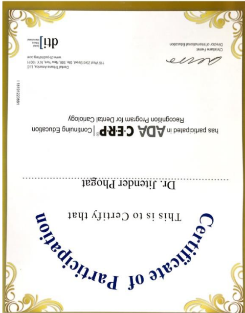
Scanned with CamScanner