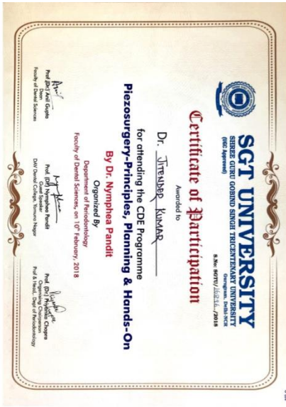
Scanned with CamScanner