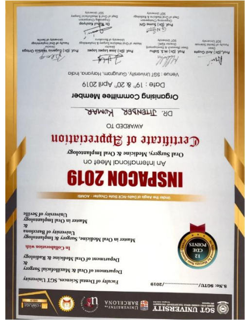
Scanned with CamScanner