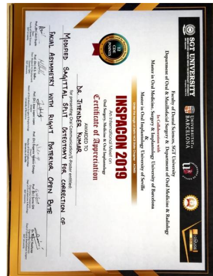
Scanned with CamScanner