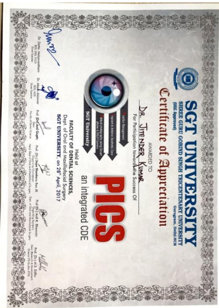
Scanned with CamScanner