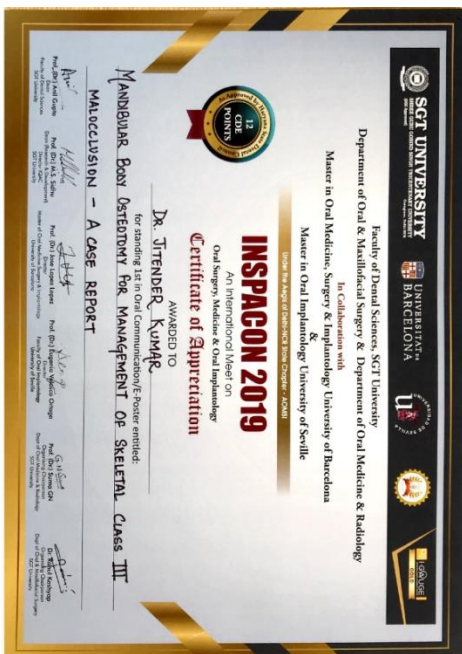
Scanned with CamScanner