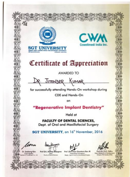
Scanned with CamScanner