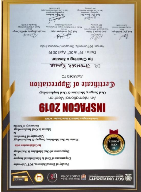
Scanned with CamScanner