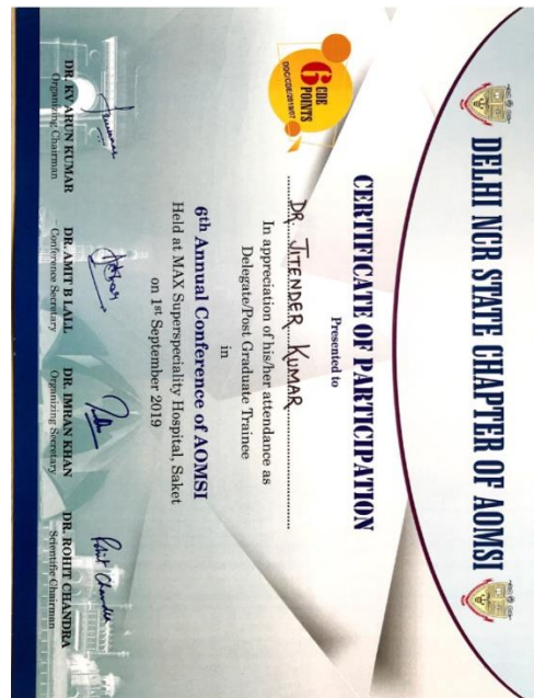
Scanned with CamScanner