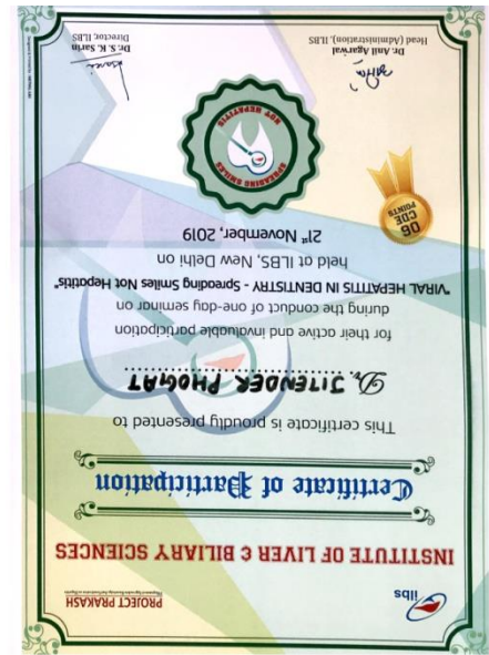
Scanned with CamScanner