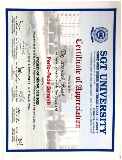
Scanned with CamScanner