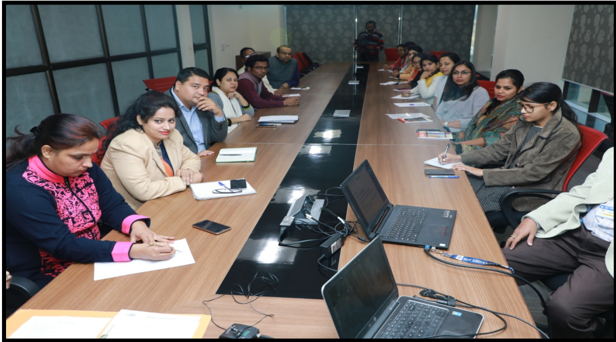
The Audience of the FDP Programme

Budhera, Gurugram-Badli Road, Gurugram (Haryana) – 122505 Ph. : 0124-2278183, 2278184, 2278185