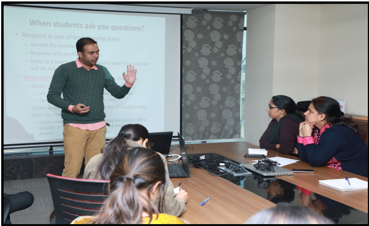
The Representative from JPHIEGO addressing the audience