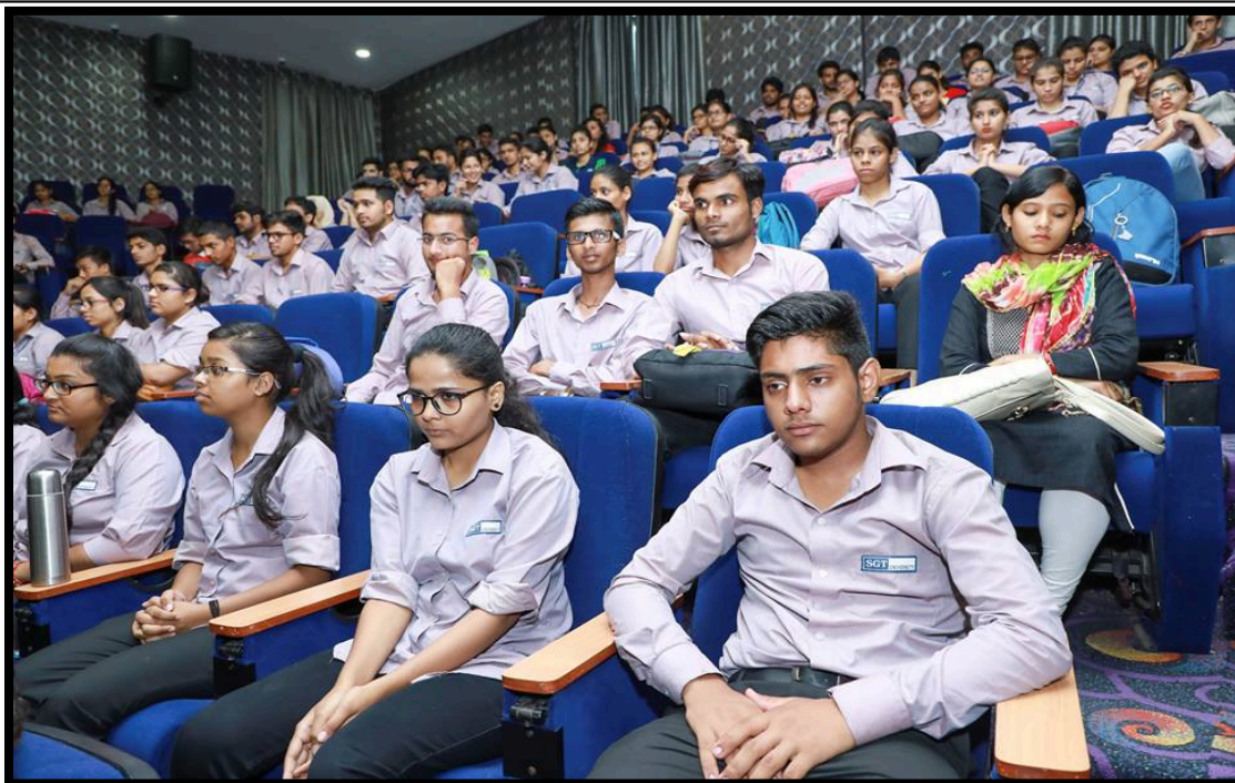
The large target audience comprising of UG Students, PG Students, interns and faculty members of from the Faculty of Dental sciences, Medical sciences, Allied health sciences, Pharmacy, Ayurveda and Behavioural Sciences