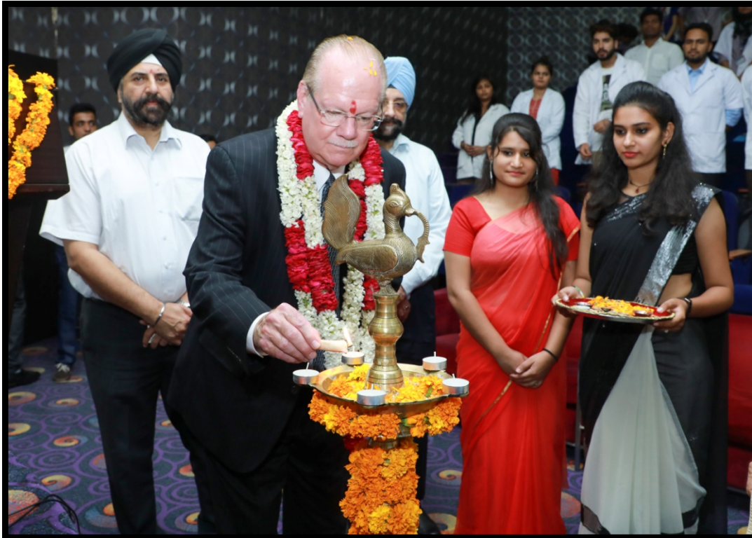
Lamp Lighting by the Dignitaries

Budhera, Gurugram-Badli Road, Gurugram (Haryana) – 122505 Ph. : 0124-2278183, 2278184, 2278185