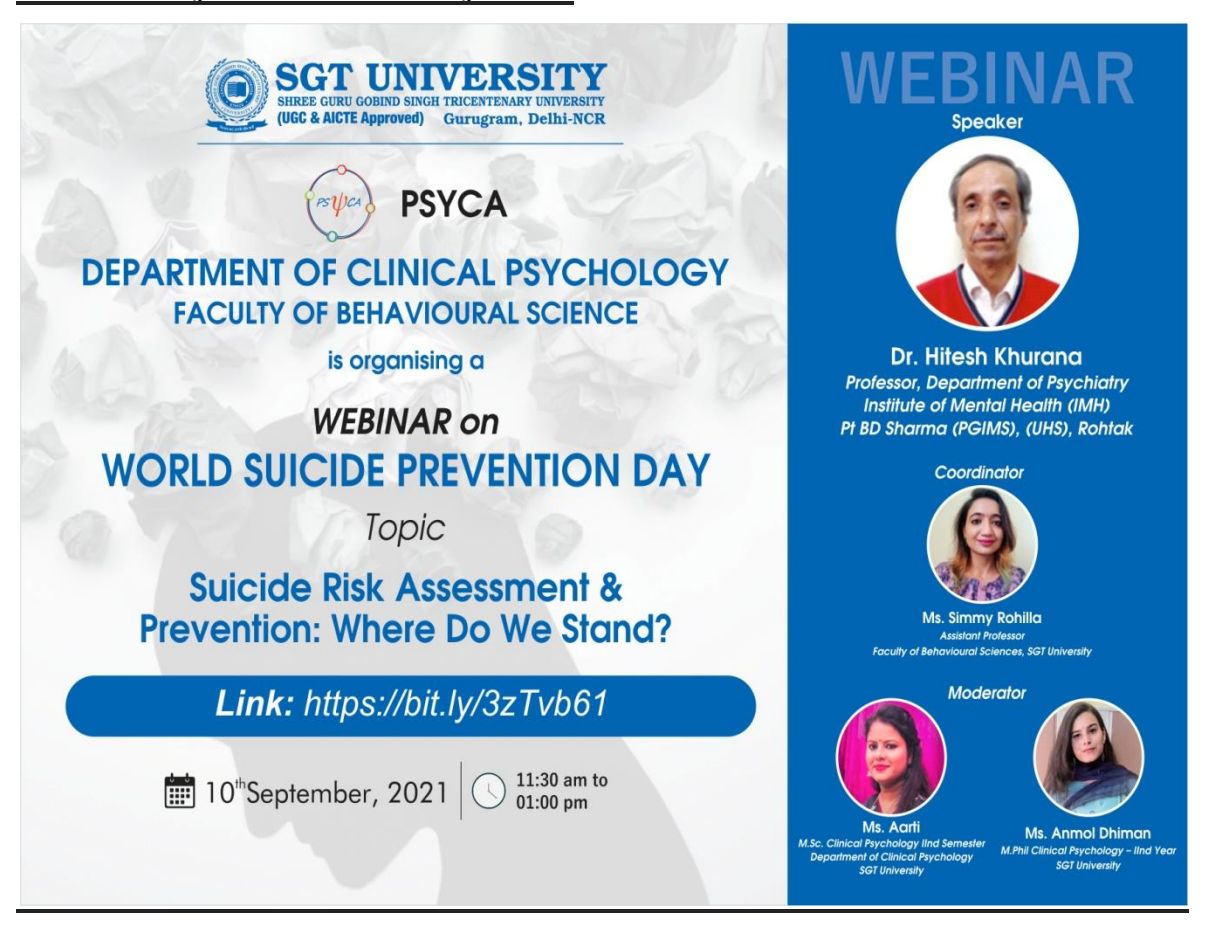
Figure 7: Banner of the webinar of Suicide Risk Assessment & Prevention: Where do we stand?