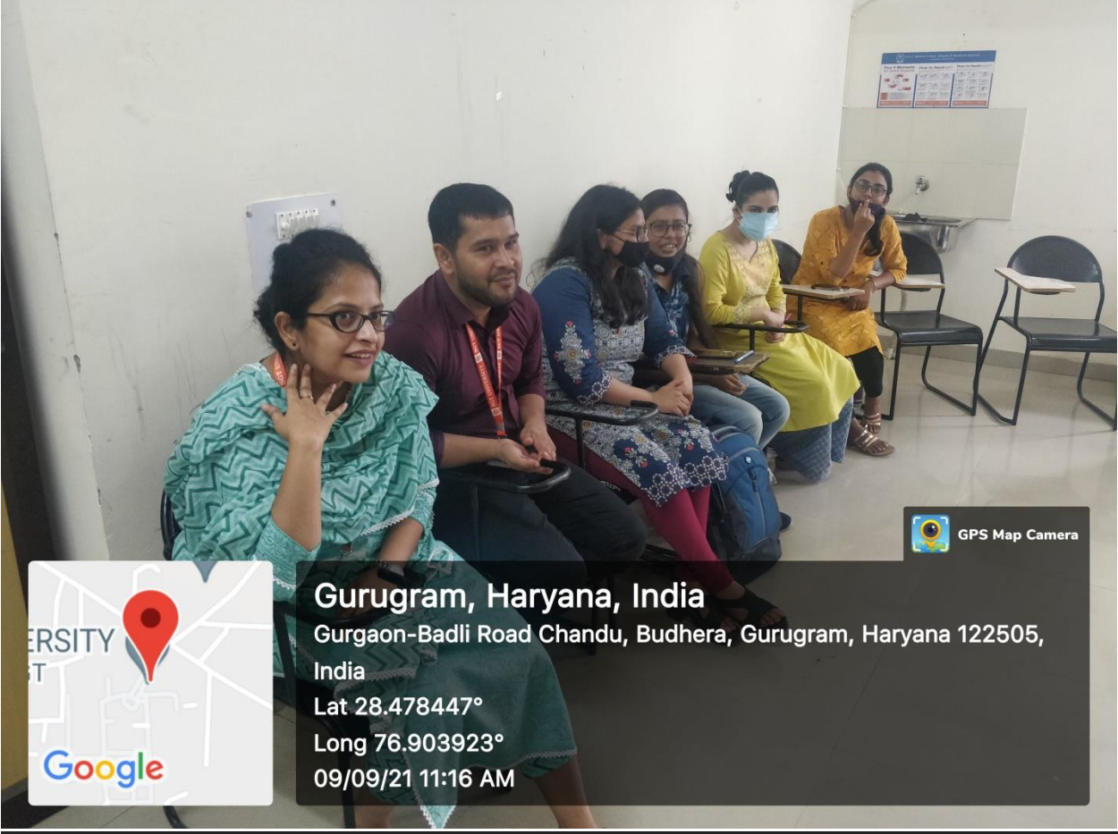
Figure 3: FBSC Faculty and new trainees during the Ice Breaking sessions.