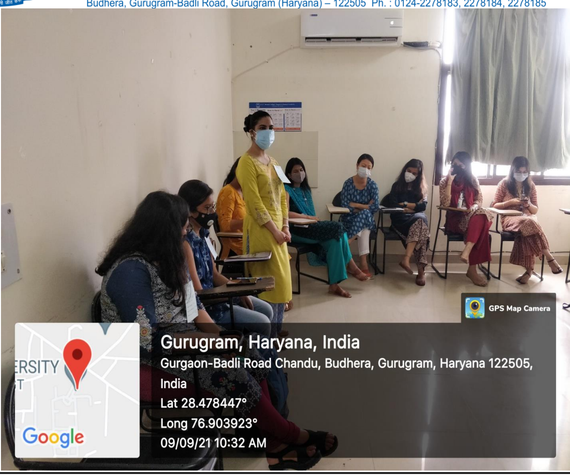
Figure 2: Students interacting with seniors and batch mates.

Budhera, Gurugram-Badli Road, Gurugram (Haryana) – 122505 Ph.: 0124-2278183, 2278184, 2278185