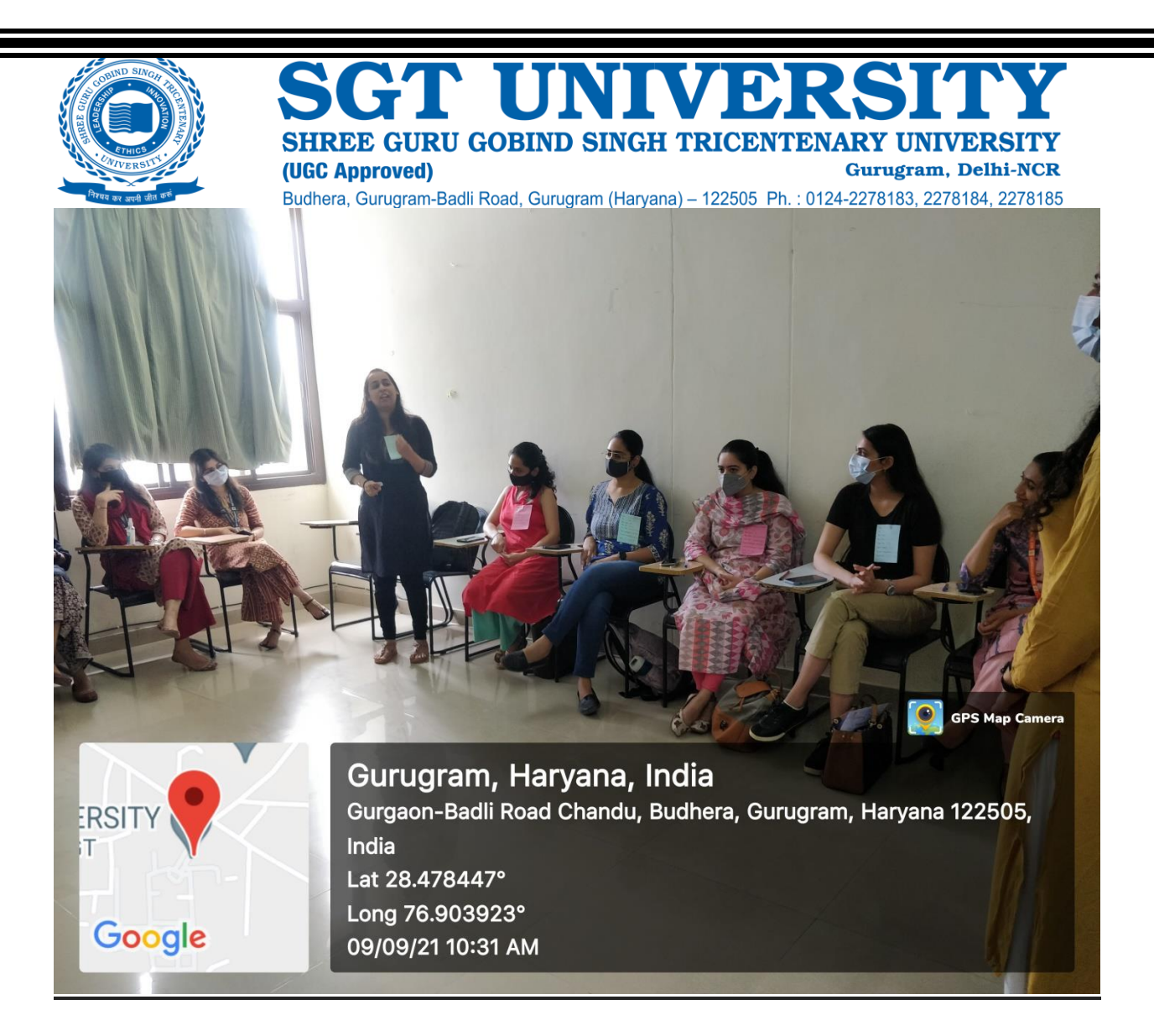
Figure 4: Students interaction during the Ice Breaking sessions.