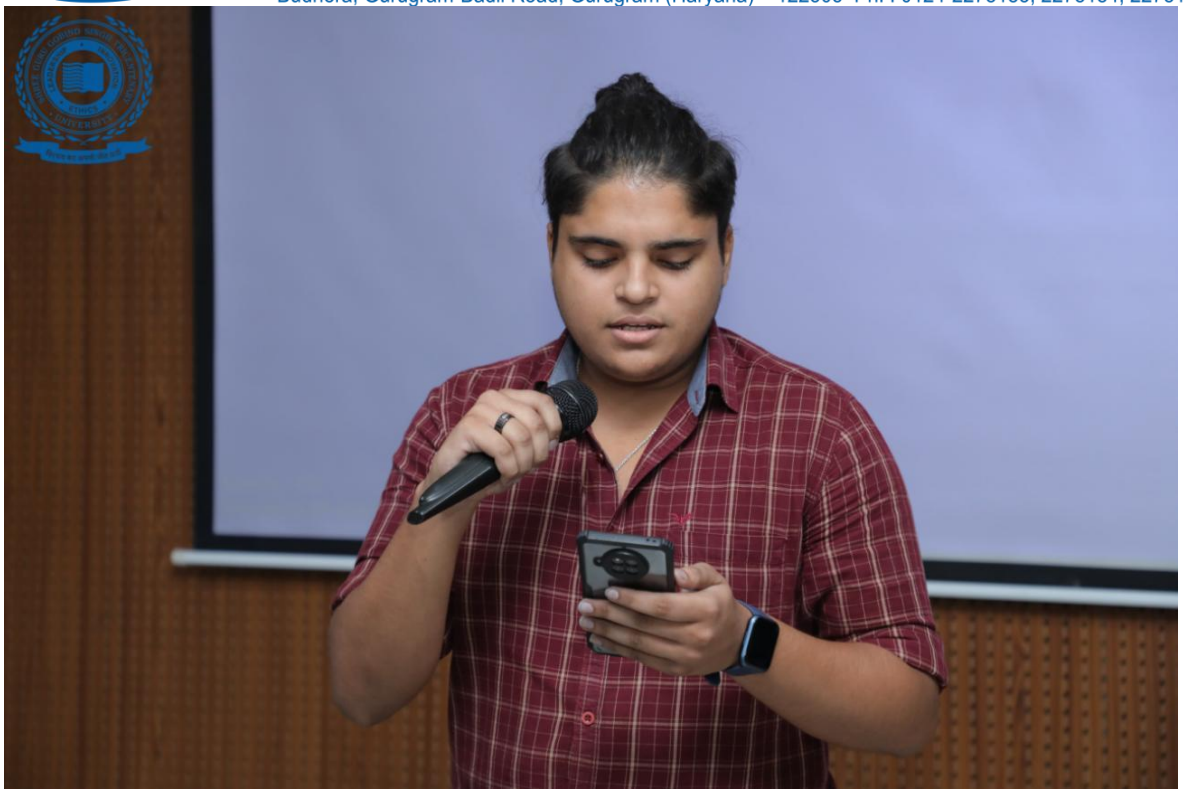
DAY 2: 26 August 2022

Budhera, Gurugram-Badli Road, Gurugram (Haryana) - 122505 Ph.: 0124-2278183, 2278184, 2278185