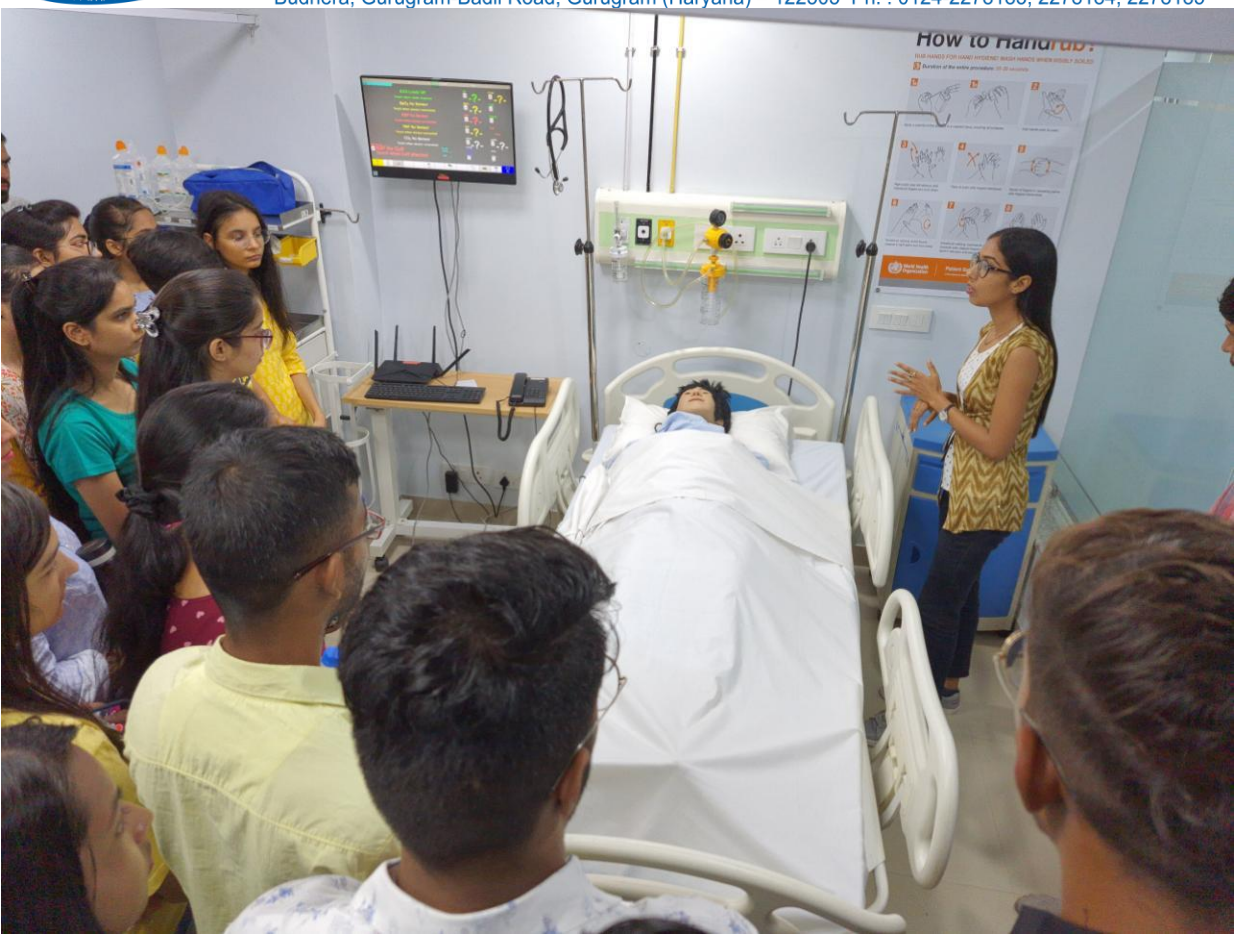
DAY 5: 30August 2022

Budhera, Gurugram-Badli Road, Gurugram (Haryana) – 122505 Ph.: 0124-2278183, 2278184, 2278185