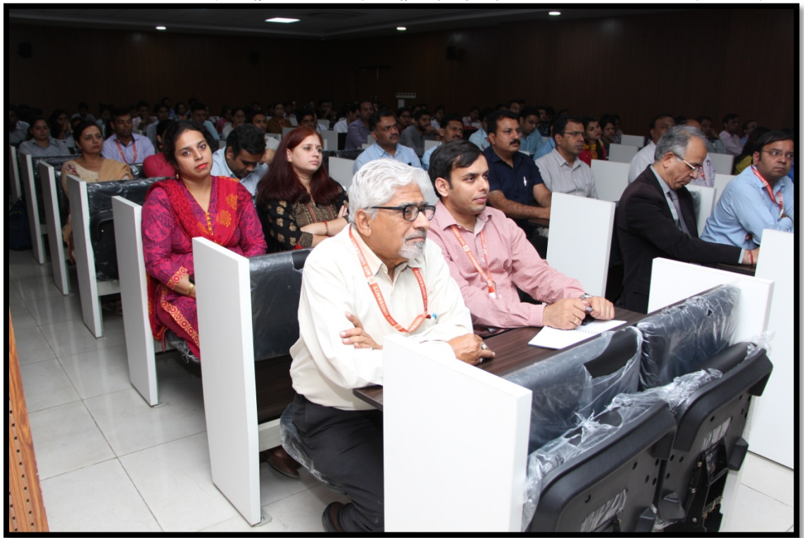
Faculty members as audience for the expert talk

Budhera, Gurugram-Badli Road, Gurugram (Haryana) – 122505 Ph.: 0124-2278183, 2278184, 2278185