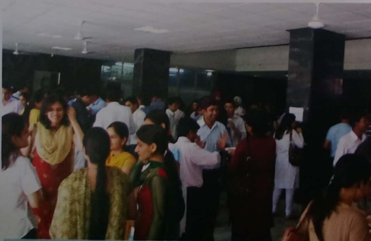
The Delegates At The Registration Counter