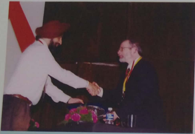
SGT JOINS HANDS WITH UDM

The Academic Affiliation Between The Two Institutes Started In 2008 With a view to broadening our horizons and expanding our academic vision, SGTDC and the University of Detroit Mercy, School of Dentistry, Michigan, USA entered into a relationship of academic collaboration. This collaboration entails organizing continuing dental education programs, discussing research cases and having student exchange programs. The academic affiliation helps us to give our students and faculty a global perspective in terms of clinical research and creating in them a vision and an inspiration to move beyond the boundaries of their restricted curricula, thus giving them an opportunity to think wide and grow tall..