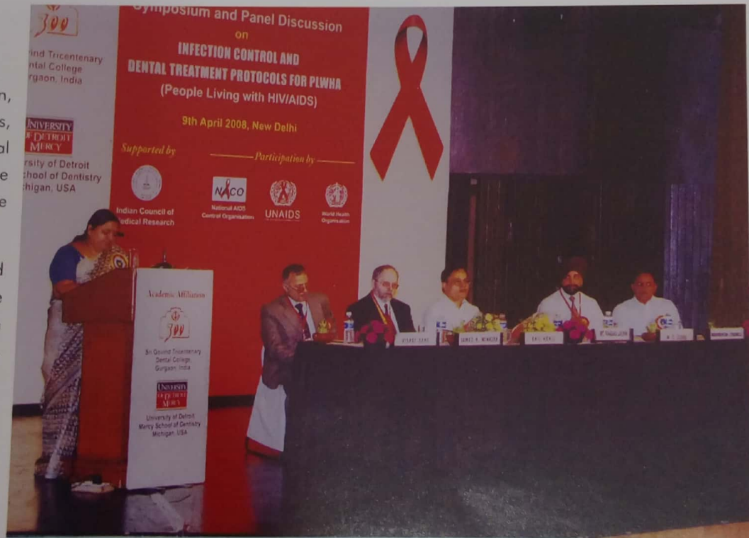
Smt. Panabaka Lakshmi (Honorable Minister of Health and Family Welfare) presiding over the function